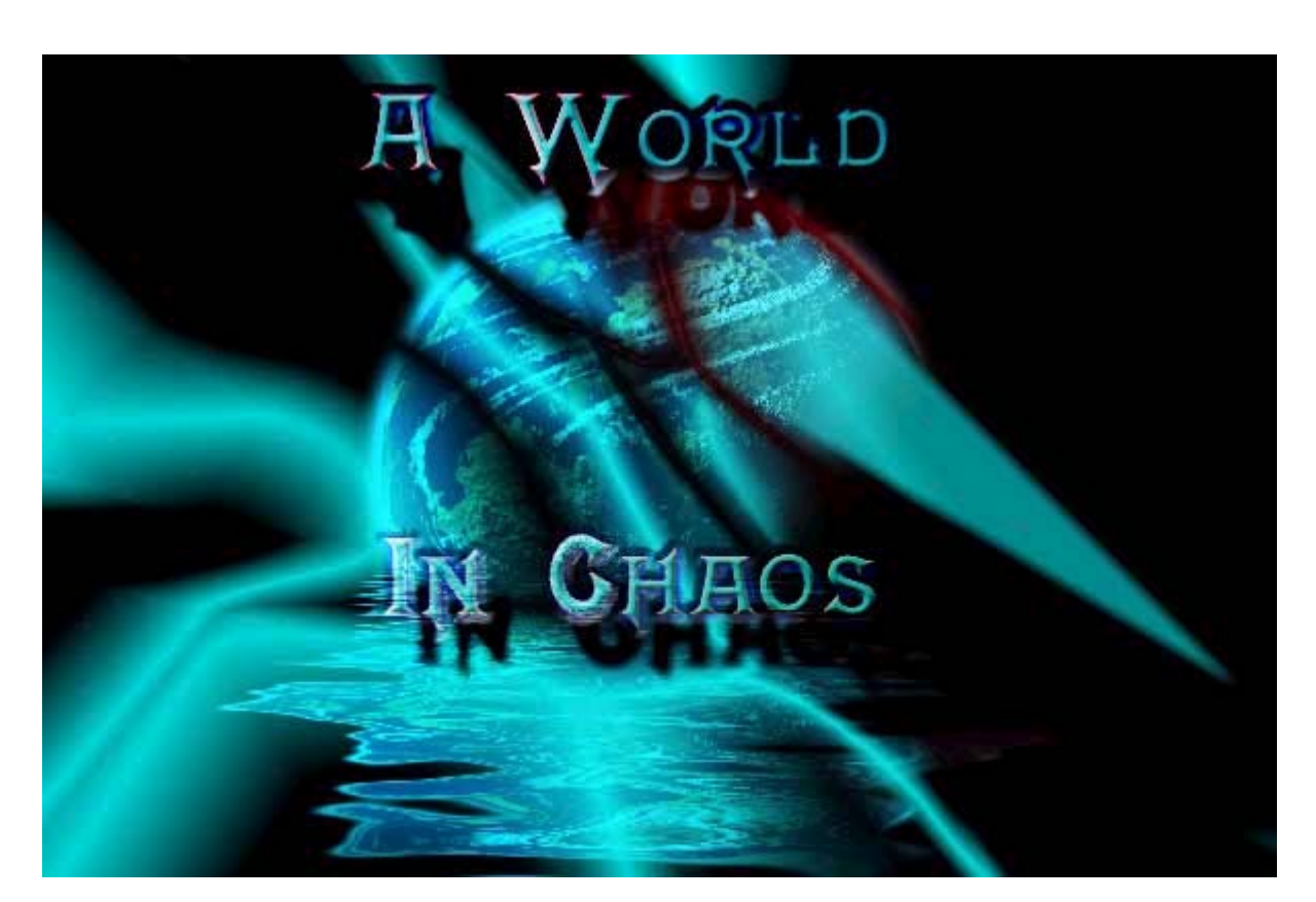
Created by Silence