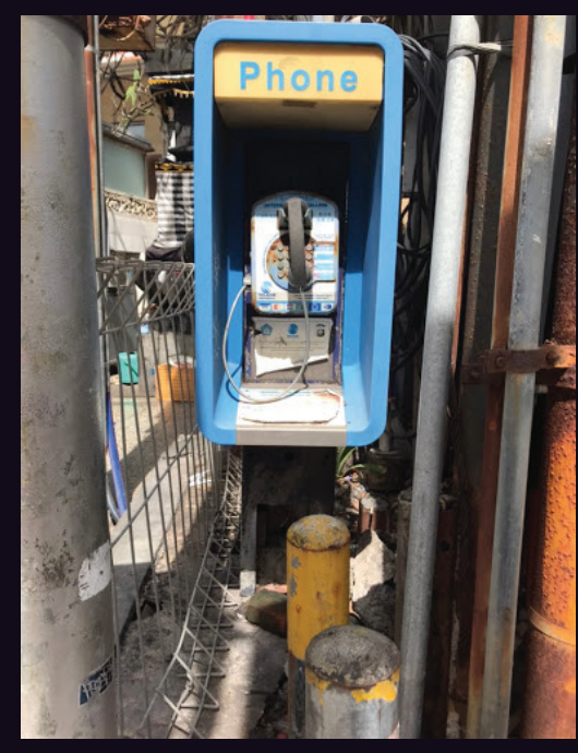
Indonesia. This perplexing phone was seen in the Kuta Beach area on the island of Bali. There literally seems to be no way to get to this phone, being caged in on both sides and having two separate pillars blocking the front.