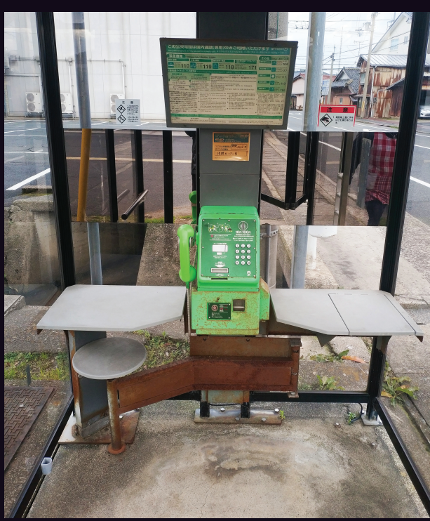
Japan. This incredibly lavish booth (with desk space!) was spotted near City Hall in Kyotango. You could have a family gathering or host a newscast inside this thing.