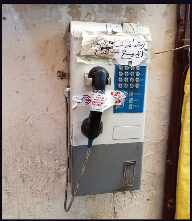
Morocco. Spotted in the Old Medina in Fez. We're Cuba. Speaking of writing on phones, you can't not sure what all the writing is about, but it looks like the idea is to discourage any use of this phone.