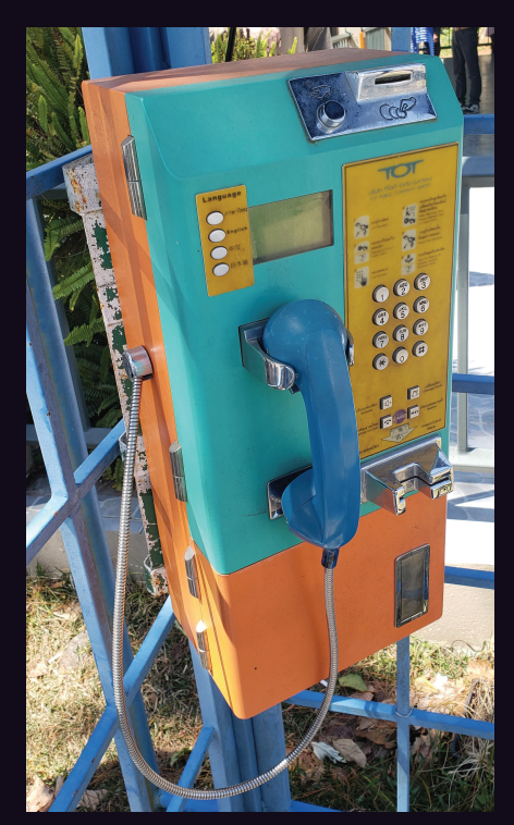
Thailand. Seen near the Myanmar border in the northern part of the country, this phone has it all: multilingual capability, the option of coins or cards, plus a whole variety of colors.

Got foreign payphone photos for us? Email them to payphones@2600.com . Use the highest quality settings on your digital camera! (Do not send us links as photos must be previously unpublished.) (More photos on inside back cover)