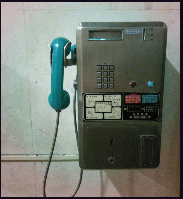
Taiwan. Found inside a laundry in Hualien City, this coin-only phone is one of those truly old school models. We'd love to know what the red and green lights do.