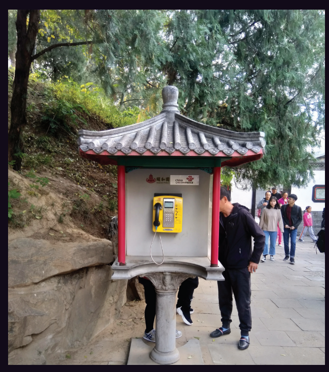
Portugal. Located outside Pena Palace and the China. Outside the Summer Palace in Beijing and