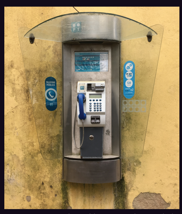
Moorish Castle in Sintra, it somehow seems to fit fitting in even more. right in.