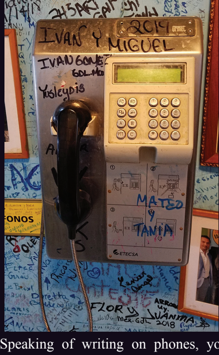
really beat this one, found in La Bodeguito del Medio in downtown Havana. In fact, it looks like the need for phones has been bypassed entirely, with messages just jotted down instead.