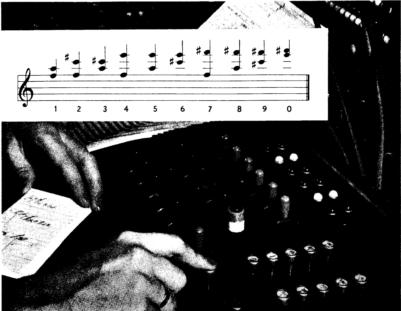
Above is the Bell System's new "musical keyboard." Insert shows the digits of telephone numbers in musical notation, just as they are sent across country.