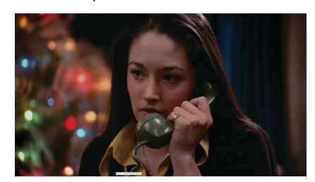
6. Candles August 2020

It would be so easy to grief these people. We could divert them with sock puppets. We could set up fake backdated blogs. We could provide keys to extracting secret messages from mainstream newspaper articles that said what we wanted them to say. It is tempting to lead them along to get them off our backs, or at least burn the story out faster. But we don't want to hurt the people who are genuinely delusional, or inadvertently trigger some random violent reaction on an innocent bystander.