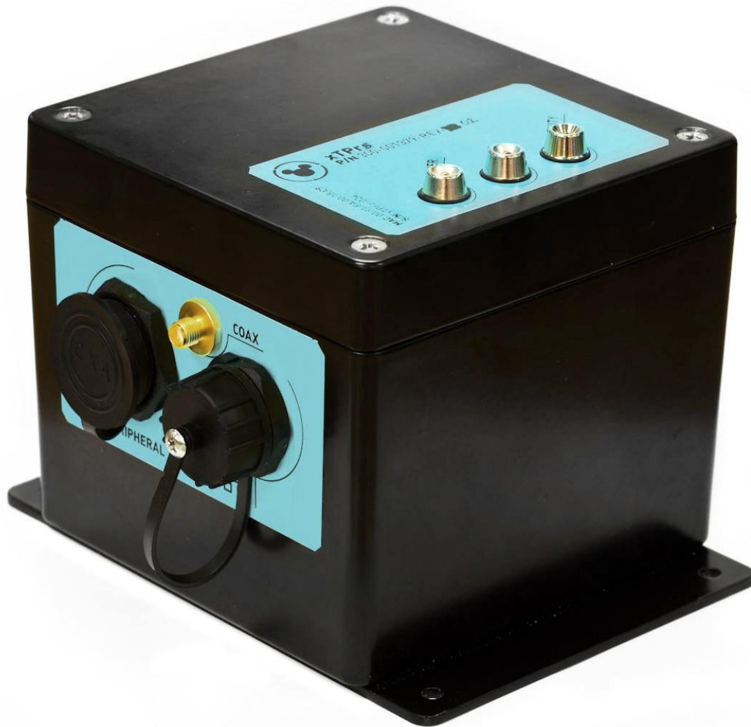
xTPrs EXTERNAL PHOTOS