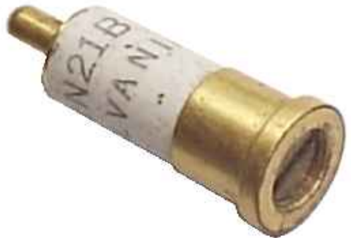
Picture 2. Early point contact diode with adjustable screw

Among the very first commercially produced diodes is the 1N21B shown on Picture 2 . It is more than curious, that this "diode" is enclosed in a case on which there is a slotted screw-head is just visible on the wide side (lower right). That screw is connected to a fine "cats whisker" steel wire, a few turns of a spring-like device, terminating in a point that is in touch of the germanium semiconductor material connected to the top left diode terminal.