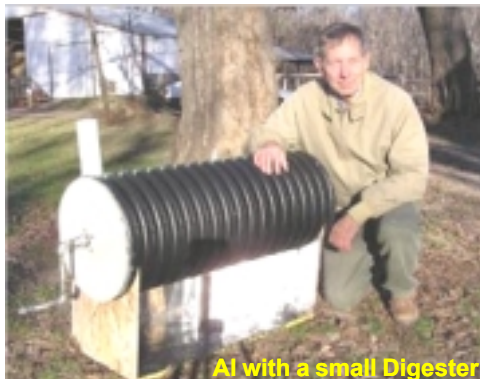
Al with a small Digester

First printed in Home Power #27 • February / March 1992 Alternative Fuels