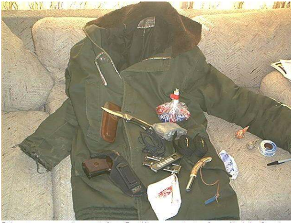
Parkas can carry an amazing amount of gear.

The items you carry must have a purpose for being carried. Don't stuff items into your kit like a baseball and glove if those items serve no purpose to keep you alive. They will just add bulk and weight to your kit forcing you to leave it behind. Three relatively bulky items you will need to