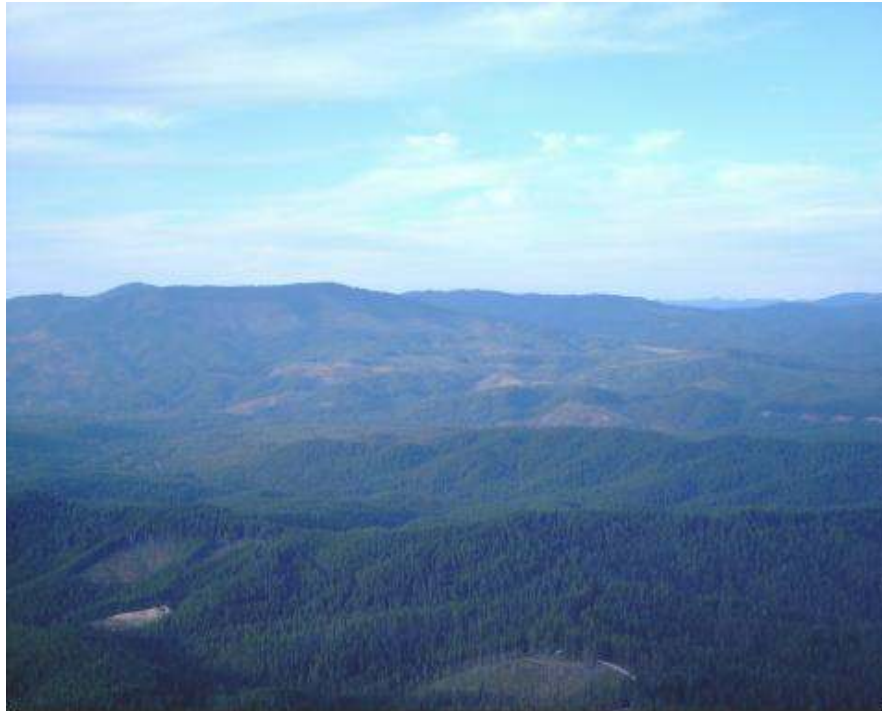
The view from Betchel Butte, Idaho. This is not the country to be caught out without some survival gear.

More people are venturing into the outdoors every year. Most of these ventures conclude in a fun day of recreation or foraging. For a small minority of Americans, however, a pleasant day in the woods has turned into a fight for survival. A washed out road, an avalanche, or even a misstep has turned a few hours in the woods into a few days in the elements. When planning small outings into the backwoods many people do not prepare for emergency circumstances. You would be wise to have some survival gear with you when you venture into the backwoods. If you find yourself in an emergency situation the gear you carry could help keep you alive. What you want on hand is the classical idea of a survival kit.