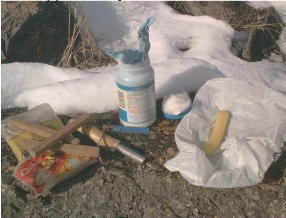
Contents of a firestarting kit left to right. Firesticks act as kindling, a firestarter for spark, used guncleaning patches and cotton for tinder and a candle.

You will need a fire building kit in your survival kit as well. Whatever circumstance has stranded you in the situation you find yourself in, it is probable that you are going to have to build a fire to at least cook food if not provide heat to remain alive. Gear for this portion of your kit is simple and very inexpensive. I like to carry some strike anywhere matches and a small sandstone to strike the matches on, a magnesium/flint and steel fire starter, dry tinder (paper, cedar bark, used gun cleaning patches and/or petroleum jelly soaked cotton balls), some dry kindling, a candle stub, tootsie-pop suckers and a lighter.