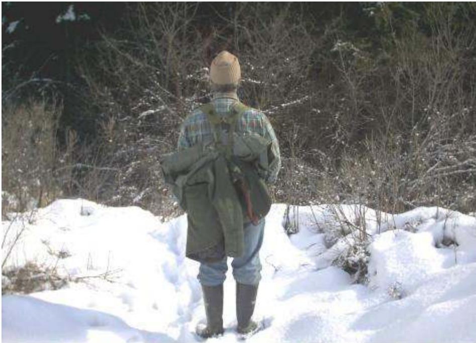
You can't carry as much on web gear, but a coat and waterproof poncho are easily hung on the back.

Backpacks might be considered cumbersome to many who are out for the hike and to collect berries, mushrooms or other foragings. Needing to carry something for their collectings, foragers sometimes find the extra bulk of carrying a backpack too burdensome and choose other methods to carry gear. This certainly allows for more maneuverability and more natural walking. The drawback to these methods is that you will be unable to carry as much gear. Fortunately, it is not the amount of gear you carry that will keep you alive. It is what you can do with it. You may find that you can carry all the gear necessary in a butt-pack, load bearing vest or web harnesses. The same rules of quality that applies to backpacks will apply to your other carry methods. Purchase web harnesses and butt-packs made from sturdy canvas with sturdy stitching. Military surplus in very good to excellent condition is a good choice. Stay away from mesh load bearing vests that unravel easily. Instead, purchase well made fishing and hunting vests that hold together well in the brush.