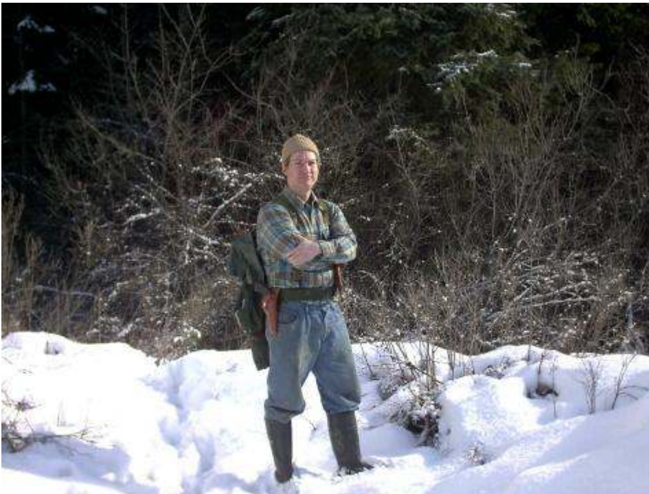
Survival kits do not need to be heavy and bulky. Knowledge and skill is more important than gear.

The skills you will build by gaining experience with your gear are far more important than merely maintaining an unused survival kit. Gear becomes important when you know what to do with it and how it can help you in any given situation. It is the knowledge you carry between your ears and the skills in your hands that will enable you to survive. The gear you choose to carry will make your goal to survive easier, however. Deciding on what gear to pack depends on