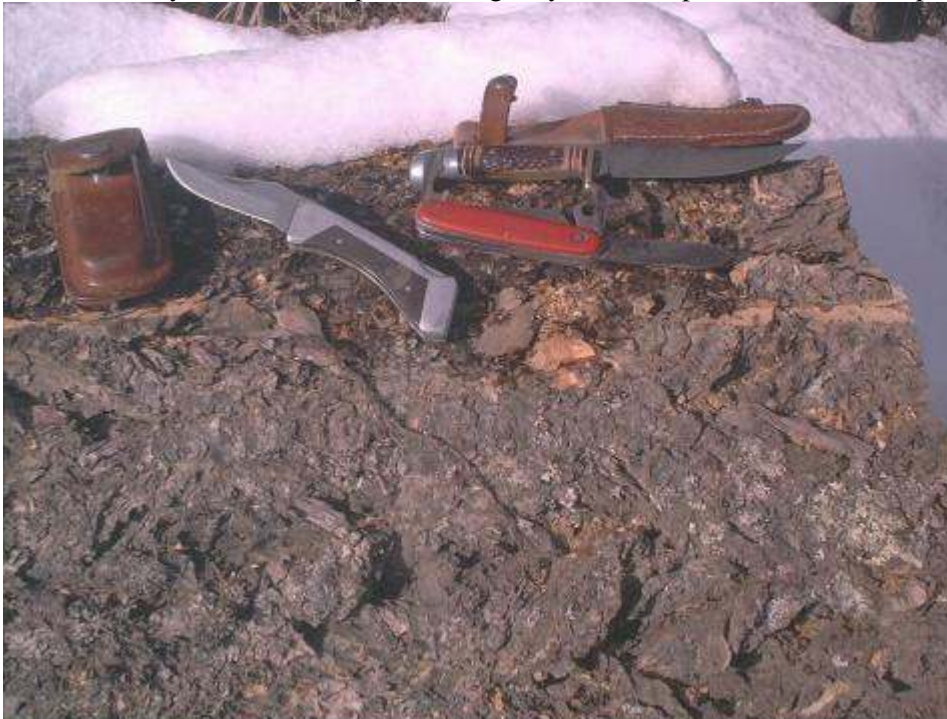
Three of the author's favorite knives. These are for cutting chores. An axe or hatchet is used for heavy chopping.

a Swiss type army knife. This knife doesn't have to have a lot of gadgets on it. All you need for this knife is at least one knife blade, a can opener and a bottle opener. The purpose of the knife blade is for tasks already mentioned. The can opener is an obvious advantage. There are other ways to open a can, but a can opener will ensure no spillage and the can may be reused to carry water, foraged food and to cook if it is not destroyed. Although most bottled drinks come with twist off caps these days, it is still possible to run across an old fashioned pressed on cap. Aside from running across older, pressed on bottle caps, it is possible for bottles to crack across their mouths making twisting off the cap a process than can break off the stem and mouth of the bottle as well as cut your hand. It is possible to gently lift the cap off with a bottle opener in this case.