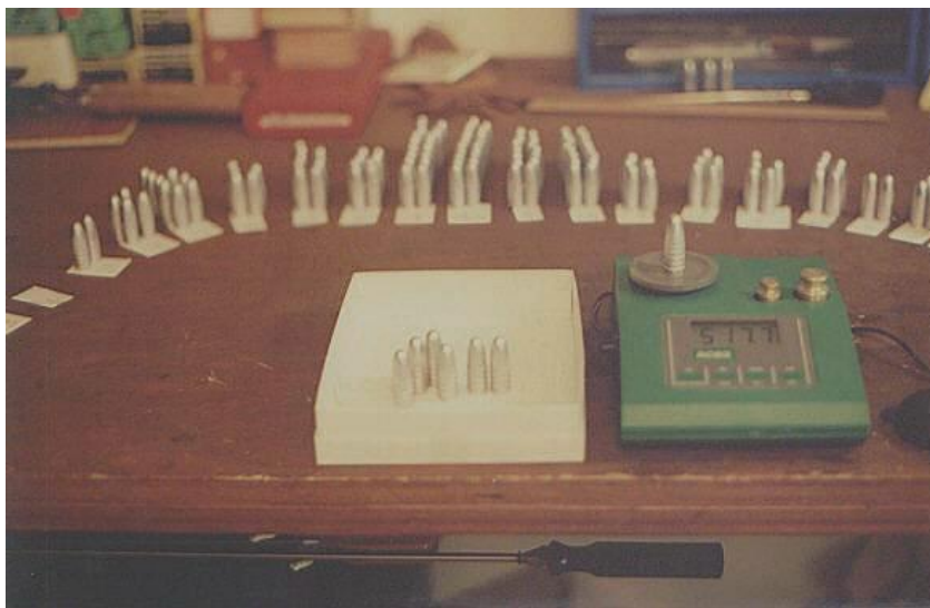
Weighing Bullets to .10 Grain tolerance

Regardless of the powder used I like to sift it prior to loading. The purpose is to remove BP fines and dust from your powder. They both are usually found in the bottom of your powder container and can lead to an inconsistent burning rate. Cal Graf Design at http://www.mcn.net/~calgraf/ offers a neat tool to do this. Basically it's a wooden box containing screened drums of different mesh size. You simply pour powder into the appropriate drum, rotate it in the box and you've removed the fines and dust or separated sizes. As with all Cal Graph products, it's well made and will last a couple of lifetimes.