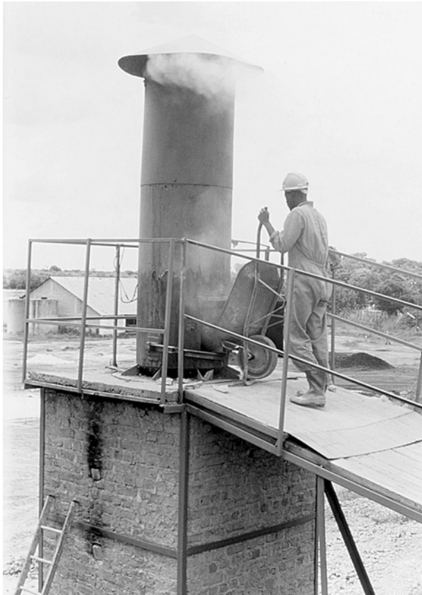
Figure 1: Loading stone/fuel through the hopper at the chimney level, lime kiln, Chegutu, Zimbabwe

If simple, field methods are to be used, it is easier to test the quality of 'lime' when it is in the form of quicklime, i.e. calcium oxide \text{CaO} . This would be the case if the lime were being bought direct from a kiln before the kiln operator had started to hydrate it. Usually, though, as quicklime will deteriorate if left exposed to the air and because it can be a hazardous material to handle, lime is more usually available and purchased as hydrated or 'slaked' lime, i.e. calcium hydroxide \text{Ca(OH)}_2 .