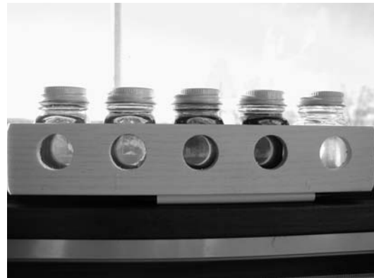
Grading is an important step in your production process. First, be sure that your grading kit is accurate, and right for your operation.

If lead is a concern, consider the equipment used in your operation. Use as much lead-free equipment as possible.