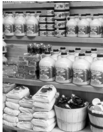
A variety of retail syrup product containers.