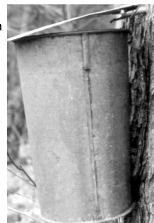
Sap gathering pail

No matter what piping you use, be certain that lines have no sags; sags trap the sap, and permit bacteria growth.