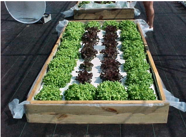
Figure 1. Lettuce in floating garden system.

The Aztecs and Incas amazed the Spanish conquistadors with their floating gardens, and now 500 years later you can impress your friends and neighbors with yours. A floating hydroponic garden is easy to build and can provide a tremendous amount of nutritious vegetables for home use, and best of all, hydroponic systems avoid pest problems commonly associated with the soil. This simple guide will show you how to build your own floating hydroponic garden using material locally available at a cost of about $40.00 (Figure 1).