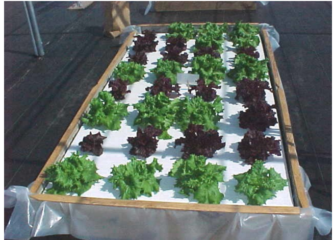
Figure 6. Healthy lettuce being grown in a standard 4x8 ft floating garden.

with floating systems does not override the normal challenges of gardening in the warm season in Florida.