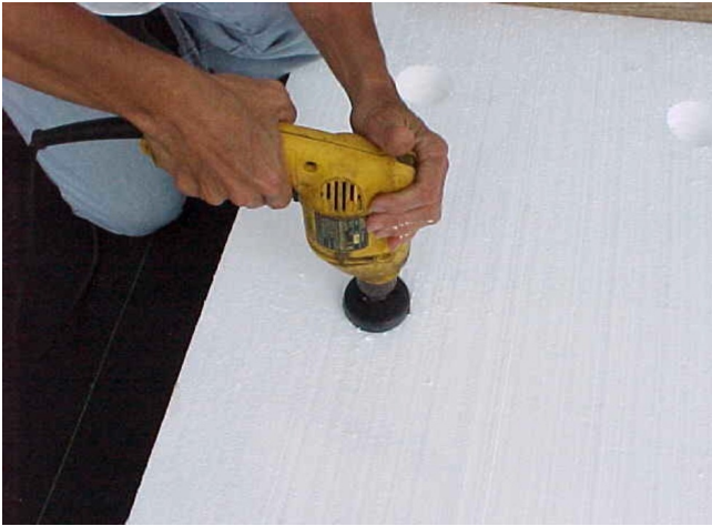
Figure 4. Drilling holes in styrofoam for transplants.