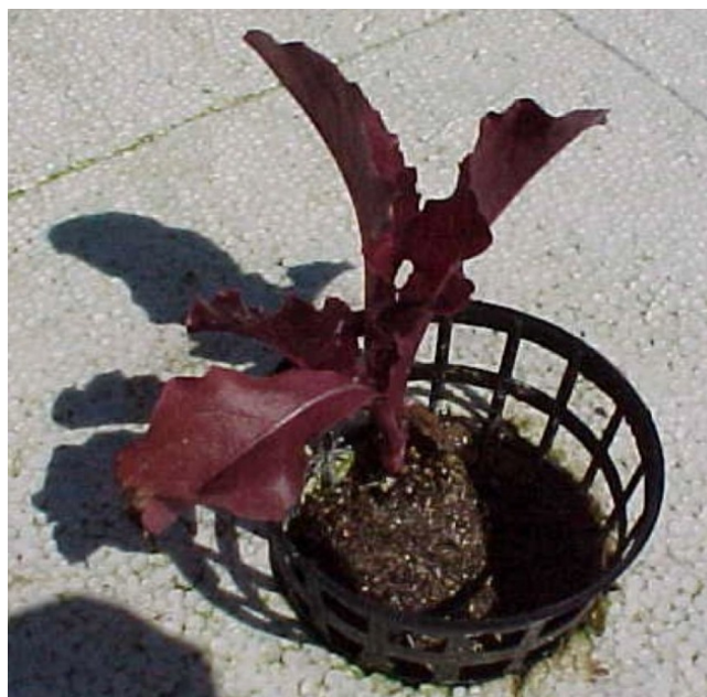
Figure 3. Lettuce transplant in net pot.