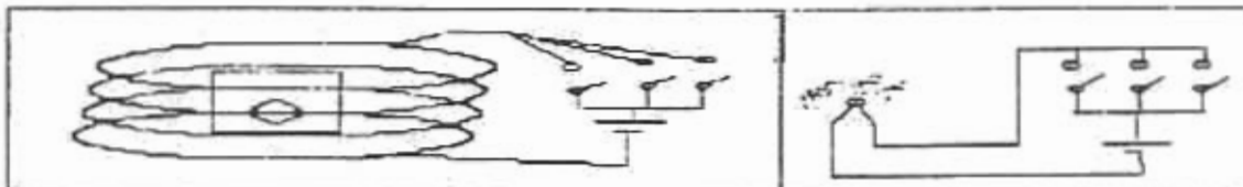
The above schematics are the guts of "burn boxes" for magnetic media (1) and paper (2). They are a simple circuit with a 6 or 12V lantern battery hooked up to either an electromagnet or solar igniter. The switches act as the sensing device, & multiples can be hooked in parallel. One can use any N.O. alarm sensing switch. On the magnetic media burn box, the electromagnet is salvaged from a motor coil, solenoid, or similar device and is placed next to the diskettes. The paper burn box uses a solar igniter placed in a small pile of an incendiary mixture. Easy mixtures to acquire are model rocket engine fuel, pyrodex, or a 50/50 mixture of sulfur and powdered zinc. The papers should be placed on this pile. The pile should be about 3 to 4 tablespoons. The paper burn box should be vented to prevent explosion as these mixtures can be dangerous when confined. Either burn box should be made out of metal.

Now of course the Secret Service often violates these laws despite the fact that in doing so they don't have a legal leg to stand on. They do this on the basis of a technique which has been used from the Middle Ages, down through Nazi Germany, up to the various activities of the KGB in the Soviet Union. Fear and Ignorance. People who are ignorant of the law become afraid because in being unaware of their rights they don't know what the