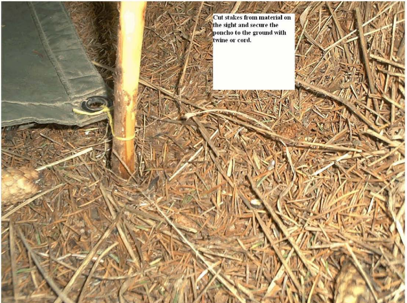
Cut stakes from material on the sight and secure the poncho to the ground with twine or cord.

As you can see, rain gear is necessary to keep your body and your clothes dry. There are several garments that are capable of performing this task and all are useful. I find the military style ponchos the most versatile and necessary to pack in with me in an emergency kit. I also keep a vinyl rain jacket with me when the season is rainy and cool, but the poncho is with me during every season because I have found it useful for protection against all elements. It provides me with shade in the summer, sheds water in the spring and fall and even sheds snow in the winter. Of all the equipment I have described so far, the rain poncho is the piece of personal shelter garment I would insist on any member of my group having on their person all the time.