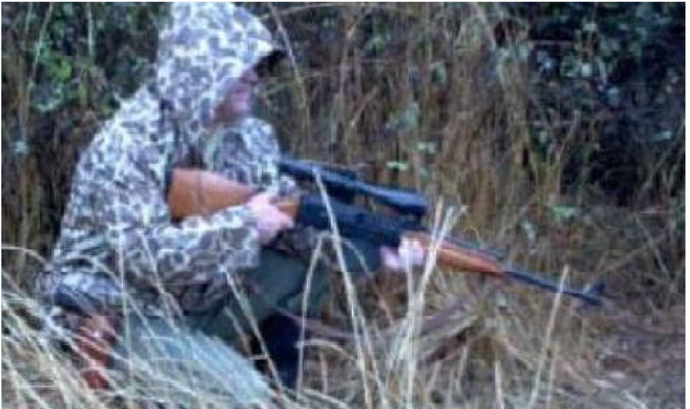
Vinyl, hooded rain jackets like this one can help keep you dry and warm.

Rain jackets made of thicker vinyl material are prevalent at many sports shops. These are just as impermeable as their frailer, lighter weight cousins and while they are still vulnerable to a good thorn poke or scratch, they are a bit sturdier and hold up much better. I have worn mine through brush and tree stands, but purposefully avoid thorn bushes and thickets. Being