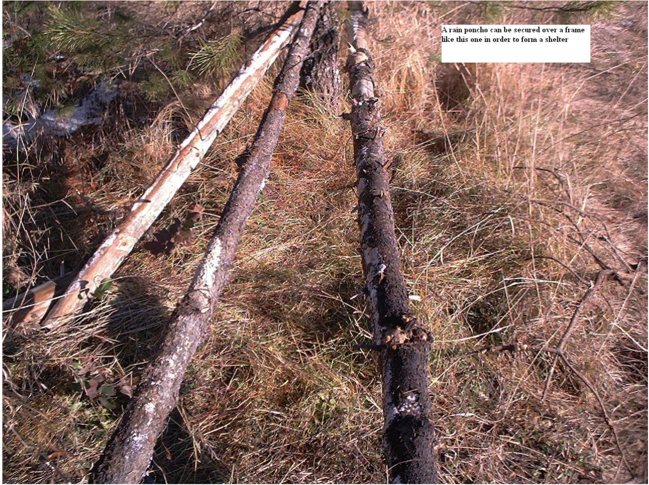
A rain poncho can be secured over a frame like this one in order to form a shelter