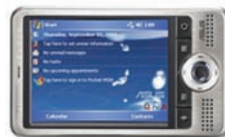
Above is an ASUS A626 MyPal® PocketPC® with Intel PXA-250 processor.