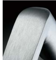
626-satin chromium plated