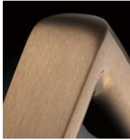
612-satin bronze, clear coated