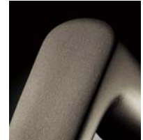
690-dark bronze, powder coated