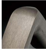
613-oxidized satin bronze, oil rubbed