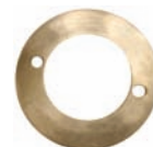
Large spacer 1 3/8" (part number 1676349)