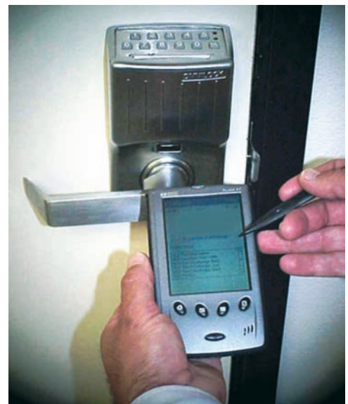
PocketPC® infrared programming of a Stanley OMNIBLOCK Magnetic Card Reader Cylindrical lock (shown above).